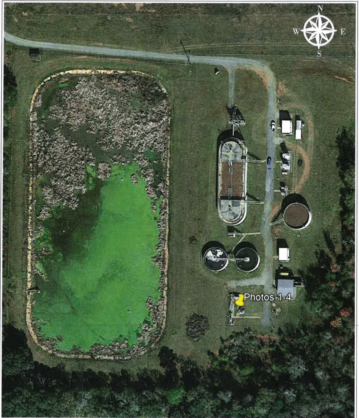
Photo Key Map

WASTEWATER TREATMENT PLANT IMPROVEMENTS FOR THE CITY OF LEESBURG LEE COUNTY, GEORGIA CWSRF APPLICATION MAP